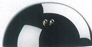
Post Prandium Lamp From $540. davidegroppi.com